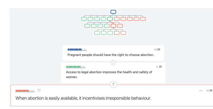
(a) An example of the arguments made in a Kialo debate. The thesis is, "Pregnant people should have the right to choose abortion". A supporting reply is, "Access to legal abortion improves the health and safety of women". An attacking reply to this support is, "When abortion is easily available, it incentivises irresponsible behaviour".