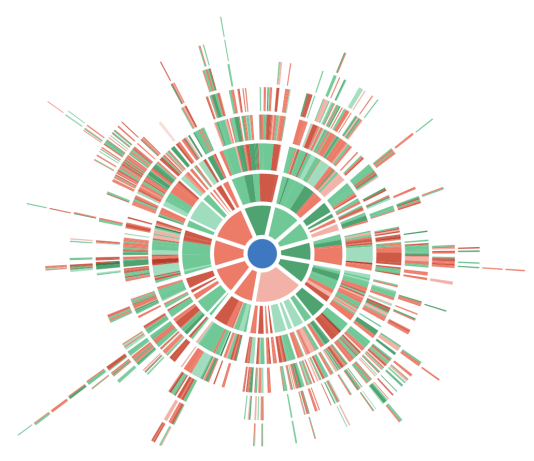
(b) Visualization of this debate's tree

Figure 1: Example of a Kialo discussion. Every debate on Kialo would start with a thesis, which in this example is "Pregnant people should have the right to choose abortion". This thesis can be either supported (shown in green) or attacked (shown in red), and the exchange can go on at multiple levels as seen in Figure 1b. Both figures are taken from https://www.kialo.com/when-abortion-is-easily-available-it-incentivises-irresponsible-behaviour-5637.1340? path=5637.0~5637.1_5637.10160-5637.1340&active=_5637.3912, last accessed 25 Jan 2022.