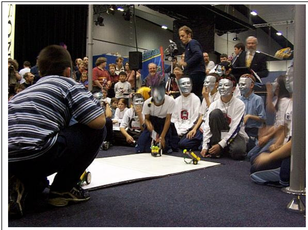
Figure 4. Creativity and teamwork: major components of RoboCup Junior