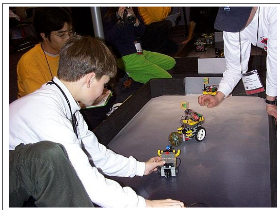
Figure 1. Autonomous football-playing robots