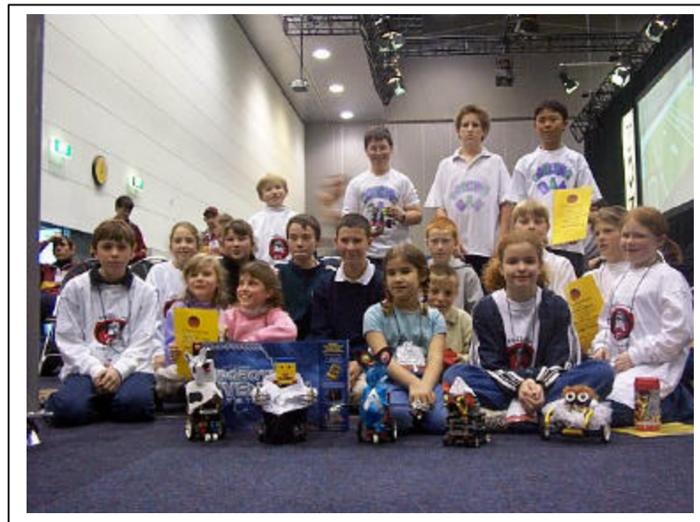
Figure 2. Children with their dance robots

In this report, we question the same “obvious” relationship between robot games and the possibility of any genuinely useful educational outcomes. We present results of a study conducted at the first international RoboCup Jr tournament, which was held in Melbourne, Australia in September 2000, as part of RoboCup-2000. About 40 teams of children, 8 to 19 years old, participated in three robot challenges. Like Amsterdam, Melbourne too was electric, and some of the entrants were stunning, especially the newest challenge – a creative “dance” program.