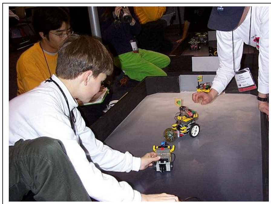
Figure 1. Autonomous football-playing robots