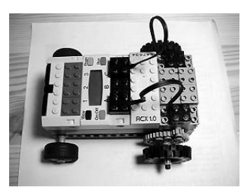
Figure 3. Go-cart, on left, and Robot, on right.